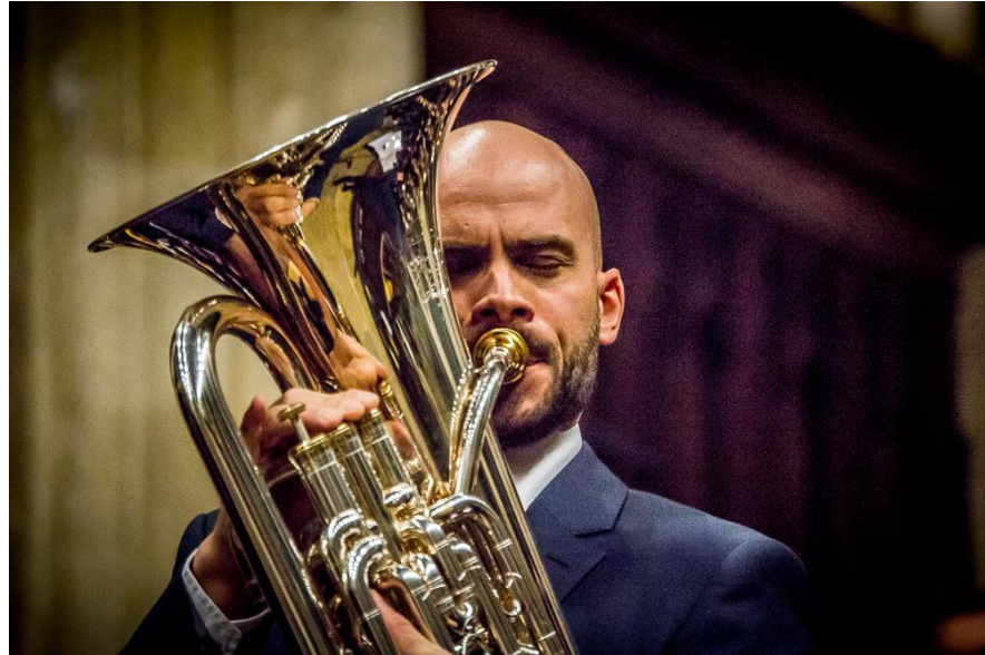
All Saint Church Maidstone 2019