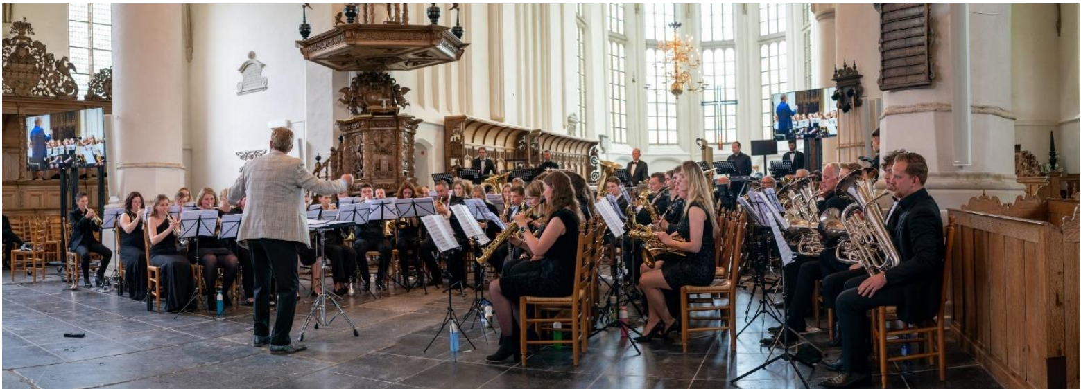
Frisia meets Anglia Martini church, Bolsward (Frisia), June 2022

By playing together, they will progress to a higher musical and technical level.